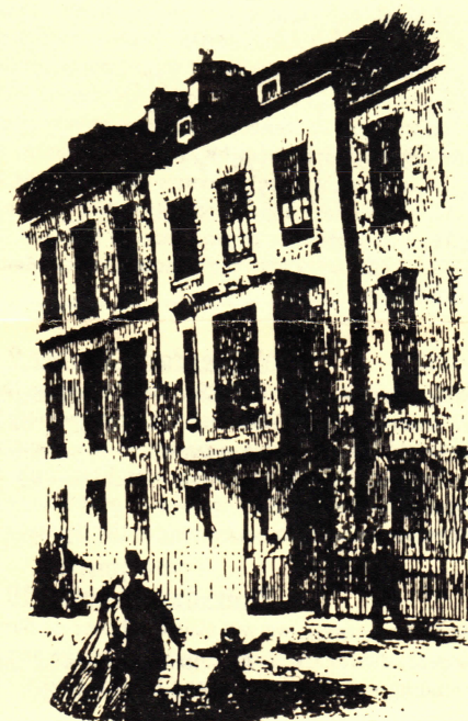
Franklin spent many happy years in this house on Craven Street in London.